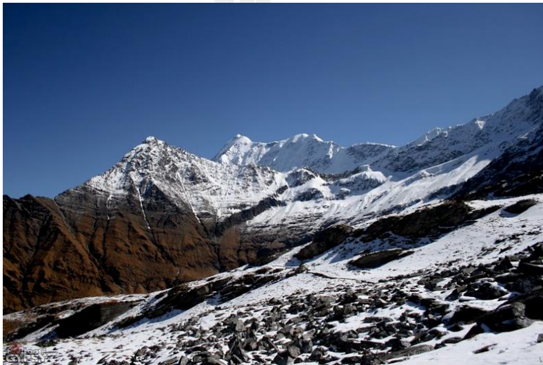
Trek route to Roopkund