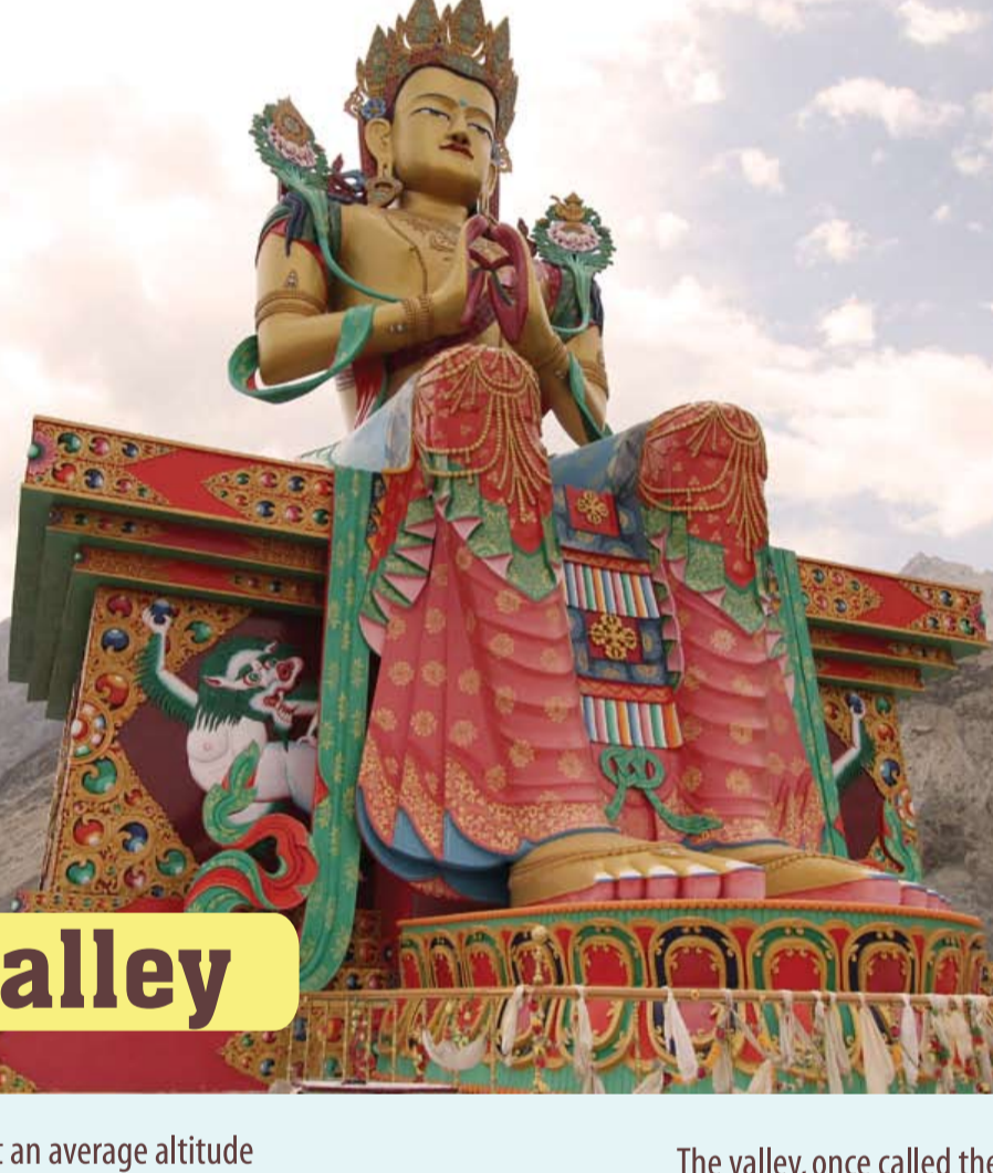
The Deskit Monastery

The Nubra Valley lies at an average altitude of around 10,000 ft above sea level. Situated roughly 150 kms from Leh, the best way to access the valley is over the Khardung La Pass, which is the highest motorable road in the world at 18,380 ft!